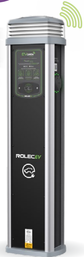
Unit shown: QUANTUM:EV SUPERFAST EV OPENCHARGE 2way Socket (Type 2) Charging Pedestal

Available in either 1way or 2way versions, providing Mode 3 superfast charging in 11kW or 22kW speeds, this unit features a built in GPRS antenna and Ethernet connection.